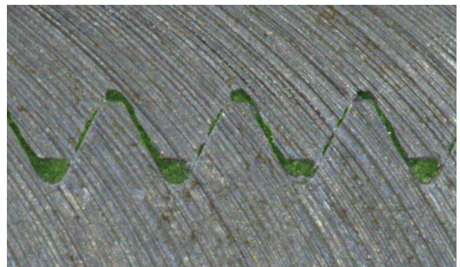
EAS in threads.

ND INDUSTRIES 1000 N. Crooks Road, Clawson, Michigan, 48017 USA Email: products@ndindustries.com Phone: 248.655.2503 • www.ndindustries.com