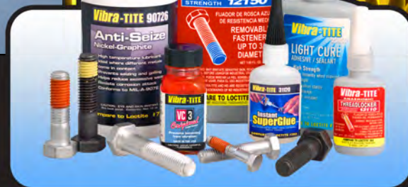
Adhesives & Sealants Division