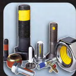
ND Patch®, ND Pell-It®, ND Strip®