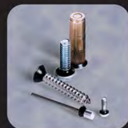
ND Plastisol™ Applied-To-Metal

1000 North Crooks Road • Clawson, MI 48017 USA • Phone: 248-288-0000 • Fax: 248-288-0022