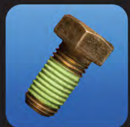
ND Expand-A-Seal ES0105®